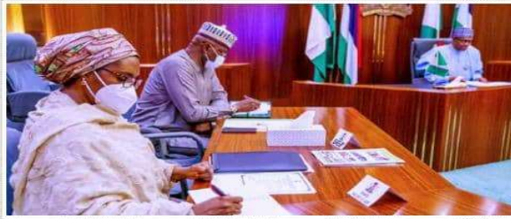
R-L: President Muhammadu Buhari, SGP Mr. Boss Mustapha, and Minister of Finance, Budget and National Planning Isah Ahmed, during the Opening Address of the 2020 Annual Kaduna Economic and Investment Virtual Summit at the Presidential Villa Abuja yesterday

doing it best in tracking and monitoring to ensure the citizens inputs in the budget.